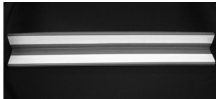
B. Photo of 48" Pad with tape placed \frac{1}{4} " to \frac{1}{8} " from the edge.

If you require extra pad or tape, please call us at 770 252-4200.